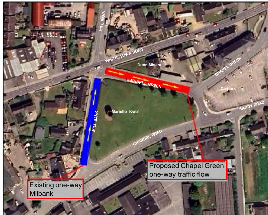
Aerial View Scale NTS