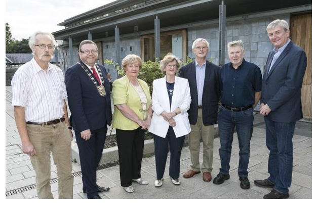
Sharing Stories Event

National Heritage Week took place from 18<sup>th</sup> – 26<sup>th</sup> August 2018, with this year's theme being 'Sharing Stories-Making Connections'. There were a total of thirty-three events in Fingal, twenty of which were supported or organised by FCC. Events were wide-ranging, and included Stair agus Gaeilge Caisleán Shoird ; Bremore Archaeological Survey with CHERISH; What Lies Beneath -Fingal Geophysical Survey project and Sharing Stories with Fingal Heritage Network. These well-received events reflect the deeply held interest in the heritage of Fingal.