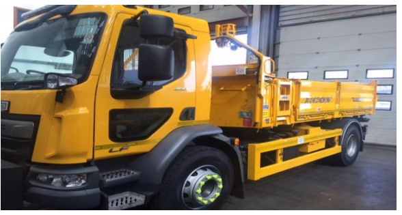
New gritting truck

Seven new snow ploughs have been ordered for the large tractors in preparation for winter 2018/2019.