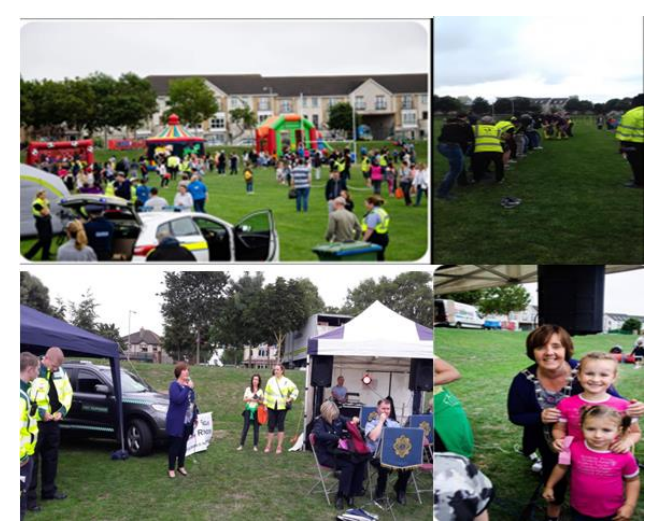
Selected images from the Meakstown Community Council 4th Family Fun Day

attempts, the contest was deemed a draw. Great fun was had by all!