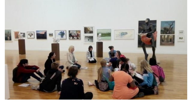
Participants of Room 13 Summer Art School immersed in art at the RHA, August 2018.

The group reconnected with the More than Bricks & Mortar exhibition at Draíocht, which was curated by them during their last term of school. They also visited the RHA to see the 188<sup>th</sup> Annual Exhibition - Ireland's largest exhibition of visual art, which includes artwork in paint, print, drawing, sculpture, photography and architecture. The project ended with a celebration in Draíocht with parents and siblings coming along to view the rich creative outcomes, and hear stories of the explorations and friendships made.