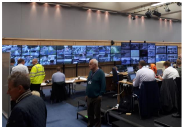
Traffic Control Centre, Dublin Castle during Pope Francis's Visit

Operations Department staff were present and advised the Gardai in the Dublin Castle Traffic Control Centre. FCC crews dealt with a number of flooding issues due to the heavy rainfall. Staff liaised with the Event Controller to clear the way for the papal escort.