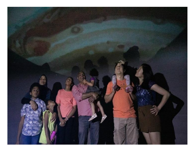
Enjoying the Big Bear Planetarium at Blanchardstown Library

One of the highlights of the day was Fingal's First Flight Competitio n, an exciting venture between Fingal Libraries and the Irish Air Corps. More than thirty excited would-be pilots lined up along the makeshift runway in the reference section, as members of the Irish Air Corps spoke about flying, and aerodynamics, before demonstrating the best techniques for making paper aircraft. A short test-flight and some adjustments later, and the competition was on! There was great excitement as the flight paths were measured and the ecstatic winners of the event were notified of their prize – a VIP tour of Casement Aerodrome.