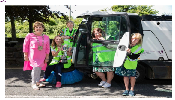
Launching the Cleaner Communities Awards

Some 54 applications have been received for the 2018 Cleaner Communities Competition, of which 35 were submitted online. Judging of all applications will take place within the month of July. The Cleaner Communities Awards Ceremony has been provisionally scheduled for September 19.