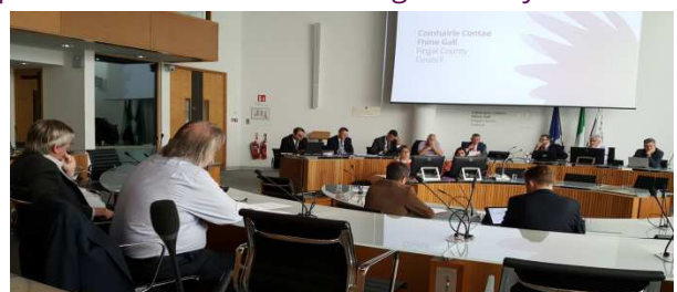
Oireachtas Members briefed by FCC Executive

The Mayor and Chief Executive hosted the annual meeting with Oireachtas members on June 22 in County Hall, to brief TDs and Senators on the priorities and activities of Fingal County Council.