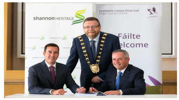
Signing the new Operator Contract with Shannon Heritage

A five year operator contract is now in place with Shannon Heritage for both Malahide and Newbridge.