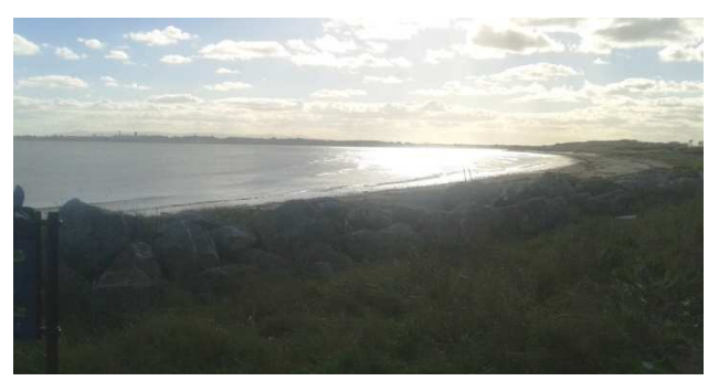
Rush South Beach

As the bathing season enters its second month water quality at all 11 of Fingal's identified and other monitored waters continues to be excellent following analysis of four sampling rounds. Details of quality on all beaches can be found on www.beaches.ie