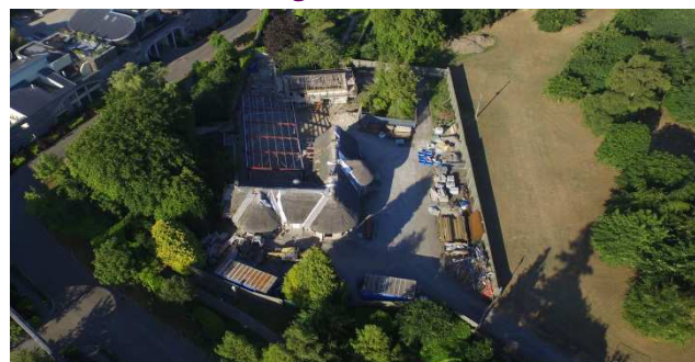
Aerial view of the on-going works at the Casino

It is intended that the exhibition and working layout design will be circulated to local Councillors later in July in conjunction with a possible site visit to the Casino building.