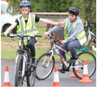
Some of the participants practicing their cycle skills

150 school children from six local schools attended a bike safety talk, a helmet and bike check, an obstacle course, safety and skills training.