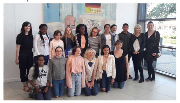
Room 13 Inquiry team at 'More than Bricks & Mortar' Opening

Room 13 Inquiry is in its fourth year in two primary schools in Fingal. The programme sees artists share an art studio space with children in the school environment, and the children visit exhibitions and places of cultural interest throughout the academic year. It is growing from strength to strength and substantial connections with Draíocht and IMMA have resulted in some wonderful opportunities for the children this year. Currently, an exhibition titled 'More than Bricks & Mortar: Works from the IMMA Collection' is open to the public in Draíocht.