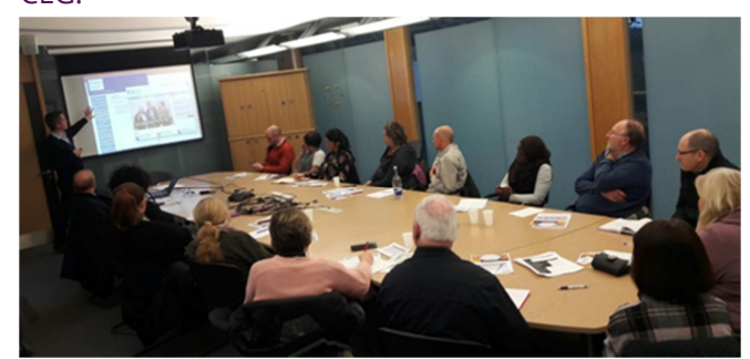
PPN Training Programme

Community Groups from across Fingal participated in the final round of the Spring Summer Training Programme that took place during the month of June. Workshops were delivered on Grant Writing, Governance and Disability Access and Awareness. The workshops were delivered in partnership with the Community Development Office and Empower CLG.