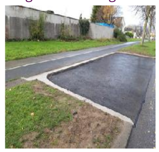
Pull-in bay on Hartstown Way (left) and Hunstown Way (right)