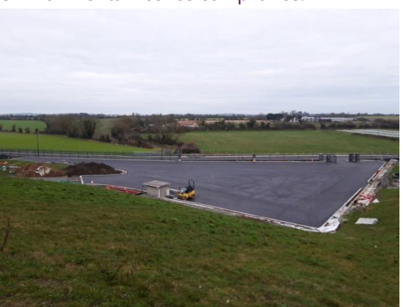
Main Visitor Parking - Rogerstown Park

quality of the surface waters being discharged. There will be a long term benefit in leachate treatment costs and an improvement in environmental licence compliance.