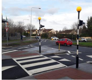
Carpenterstown Roundabout – Four Armed Zebra Crossing Commissioned in December