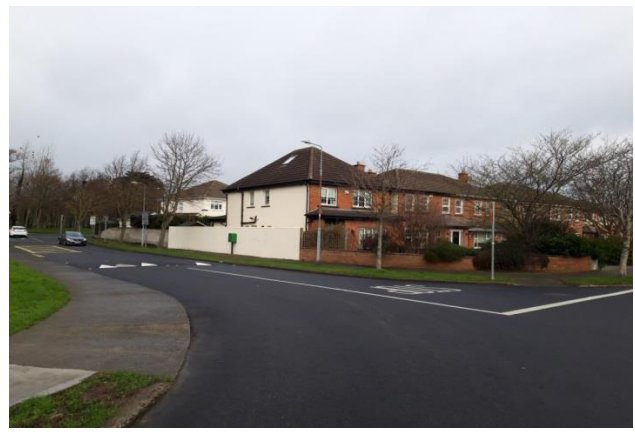
Ramp Installed on Castleknock Elm

The submissions on the ramps were presented to the Castleknock/Mulhuddart Area Committee Meeting in September, following public display over the summer. The tender has been awarded to MCM Surfacing and works are underway at present. Ramp installation has commenced and is ongoing at present throughout the county.