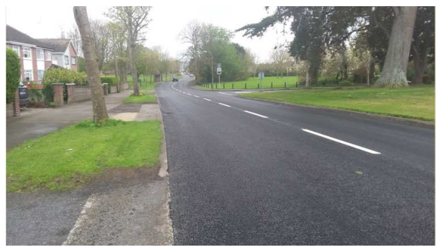
Roadworks at Swords Road/Millview Road junction are now completed:

New road surface at Lower Carrickhill road and Blackwood Lane, Portmarnock: