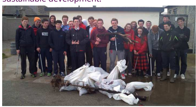
Green Schools beach clean-up Skerries

The Local Agenda 21 Environmental Partnership Fund scheme opened for applications on May 11, 2018. The Fund encourages involvement of local communities in local action and decision-making and assists them in working towards the goal of sustainable development.