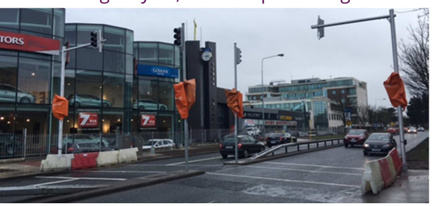
Navan Road Pedestrian Crossing

The Navan Road Pedestrian Crossing Contract by KN Networks is now 85% completed. The anti-skid surfacing work is programmed for the week commencing May 21, weather permitting.