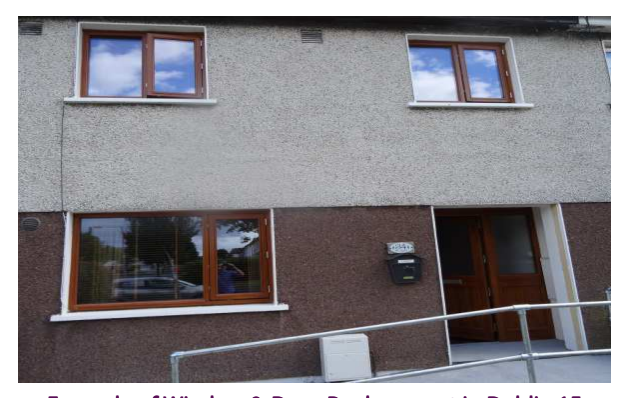
Example of Window & Door Replacement in Dublin 15

The Windows/Doors Replacement Programme for 2018 is continuing in the remainder of Sheepmoor Estate, Dublin 15. A procurement process has also been concluded in respect of Dromheath Estate, Dublin 15 and letters outlining approximate timelines for measuring will issue shortly to tenants.