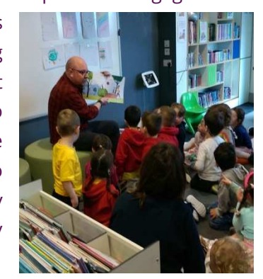
Storytime at Donabate Library

with users and assess their needs. Spring into Storytime is part of the overall Right to Read programme which aims to enhance literacy levels through family participation.