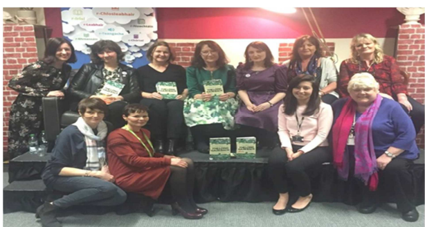
Blanchardstown library staff with the authors

able to attend during normal opening hours, due to work and personal commitments. The Late Evening events have showcased the Library as a venue for quality cultural experiences. We hope to diversify with some Late Evening, STEM (Science, technology, engineering, arts and maths) based events in the near future.