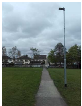
Clonard Court Balbriggan Castleknock Elms/Way