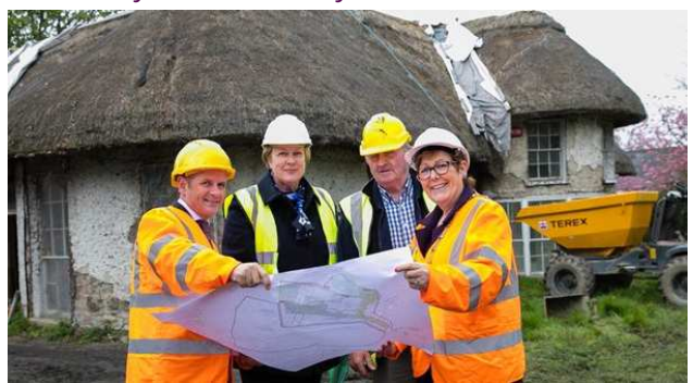
The Mayor and Chief Executive on-site at Malahide Casino

Contractors were approved in mid-April for the refurbishment and extension of the Casino cottage building to allow for use as a new home for the Fry Model Railway collection.