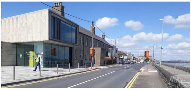
Traffic Signals 2017-Baldoyle Library