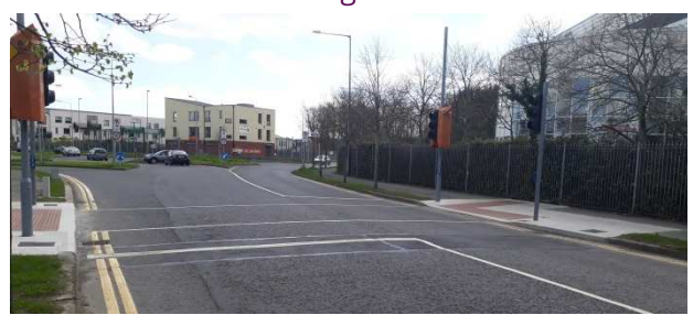
Traffic Signals 2017-Melville Finglas

The Traffic Signals 2017 Contract Work by TSL is continuing on various sites. Of the 13 sites, 12 are 80% completed and are awaiting ESB works to connect the signals. The remaining site will commence in the coming weeks.