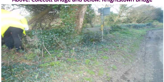
Fingal – In bloom