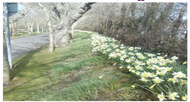
Daffodils in Ardgillan Demesne