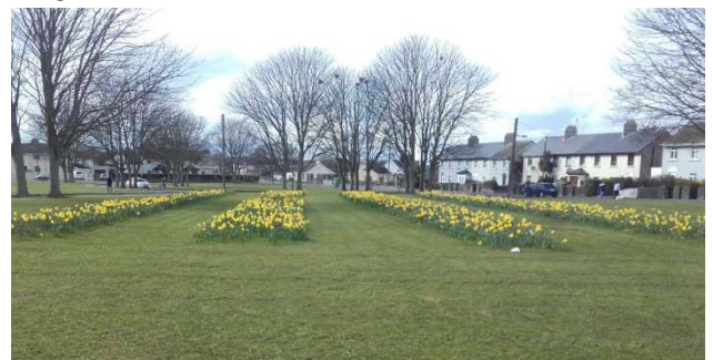
Daffodils in Craoibhin Park, Balbriggan