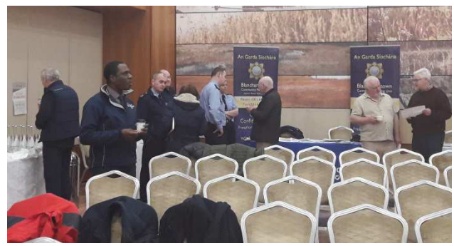
JPC Public Meeting in Blanchardstown

The first Fingal JPC Public Meeting took place on April 4 at the Crowne Plaza Hotel, Blanchardstown. The meeting had a very good attendance and featured presentations from the Criminal Assets Bureau and Community Gardai on Cyberbullying.