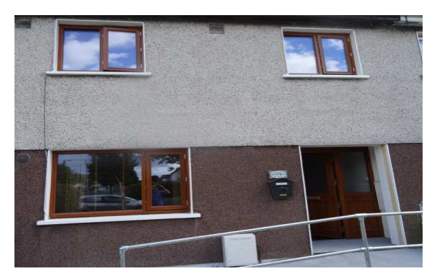
Example of Window & Door Replacement in Dublin 15

The Cyclical Maintenance Programme is continuing in Ballygara, Garristown; Bun-a-Knock, The Naul; Clonard Rise and Curran Park in Balbriggan. Works have been completed in Corduff Estate, Dublin 15, Mooretown/Seatown Walk in Swords and Rivermeade in St Margarets.