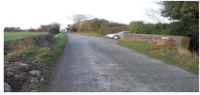
Above: Colecott Bridge and below: Knightstown Bridge

The following three bridges have been included in the 2018 programme: Colecott Bridge, Knightstown Bridge and Calliaghwee Bridge.