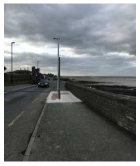
Traffic Signals 2017-Gannon Park

The Traffic Signals 2017 Contract Work by TSL is continuing on various sites. 11 sites are 80% completed and are awaiting ESB works to connect the signals.