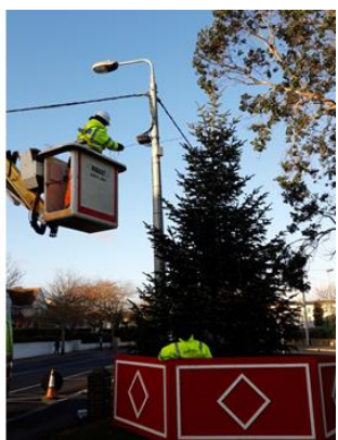
Damastown Walk, Dublin 15 and the Malahide Christmas Tree