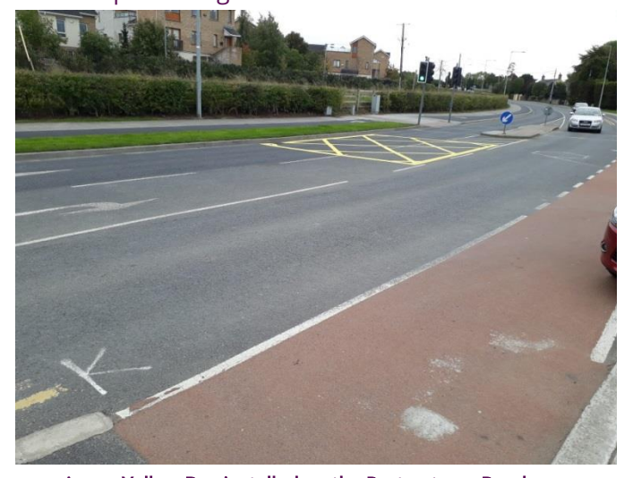
A new Yellow Box installed on the Porterstown Road

areas and will continue in the coming weeks, weather permitting.