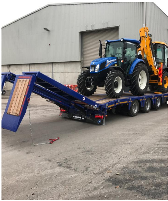
Transport of Vehicles for "Winter Ready" Launch at Saint Catherine's Park, Lucan

These tenders are in the process of evaluation and award.