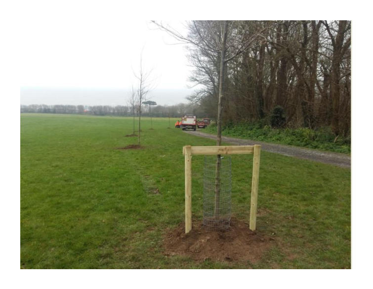
Footpath improvement works were recently completed in Santry Demesne.