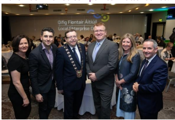
Speakers at the LEO Fingal major breakfast seminar in the Carlton Hotel, Dublin Airport on Wednesday 14th November

LEO Fingal hosted "Hire and Hold onto the Best Staff for Your Business", a breakfast seminar on best practice recruitment and retention policies for small businesses. The event took place in the Carlton Hotel, Dublin Airport on Wednesday 14th November with 80 companies in attendance.