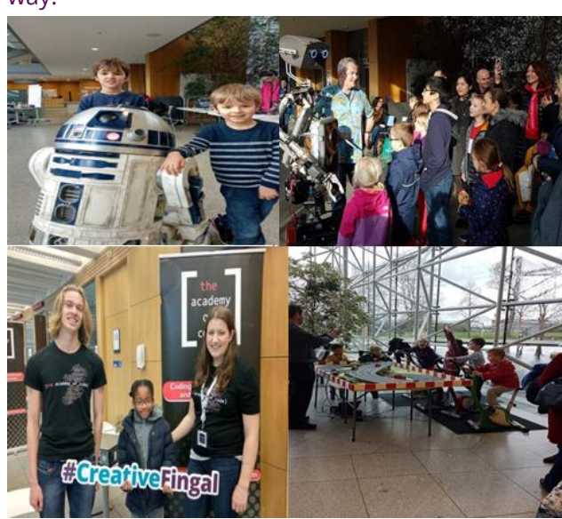
STEM Saturday at the atrium in Grove Road, Blanchardstown

Mechatrons. Ireland's leading creators entertainment and educational robots, showcased robots from TV, film and computer gaming at the events. Participants took photos with their favourite robots and interacted with those that could talk and respond! The events also featured drop-in coding for all ages and a young engineers Lego workshop. These two events are a culmination of a year-long STEAM programme in Fingal libraries, which aims to enable everyone to have access to Science, Technology, Engineering, Arts and Maths in a fun way.