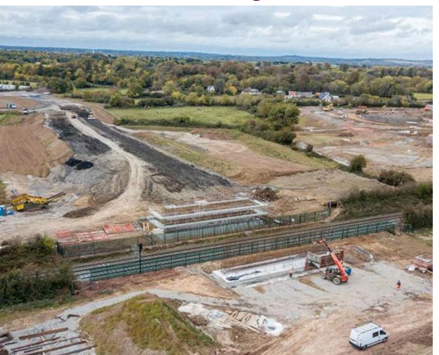
Road Widening Near Donabate Railway Bridge (R126)

The Minister for Housing, Planning and Local Government, Eoghan Murphy TD, recently visited the site of the Donabate Distributor Road and met with council officials involved in the project. Mr Murphy was particularly interested to see the new bridge structure beginning to rise up on either side of the Dublin-Belfast railway line, and this structure will form a new landmark on the north county Dublin skyline as construction continues over the coming months. When complete, the new road will facilitate a number of residential developments in Donabate as well as providing a much needed second crossing of the rail line.