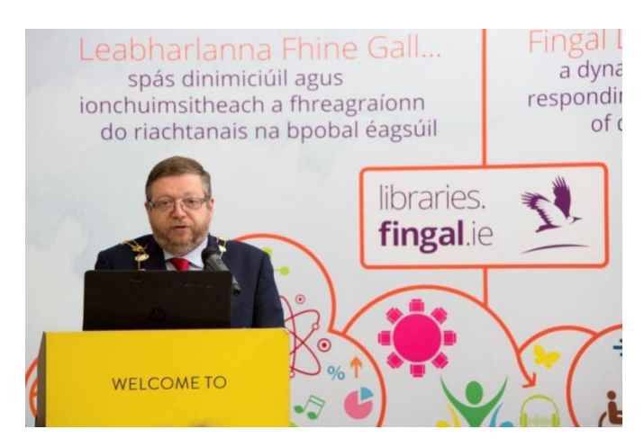
Mayor of Fingal Cllr. Anthony Lavin addresses the audience at STEMCon