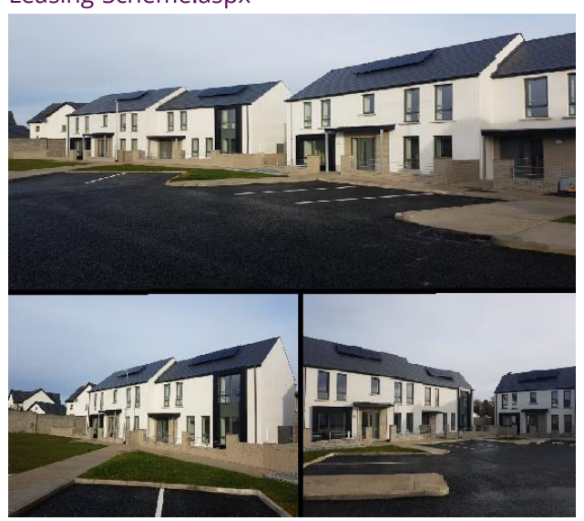
New social housing nearing completion at The Grange, Ballyboghill

Further details of the scheme are available at: https://www.housingagency.ie/News/Current-News/Enhanced-Long-Term-Social-Housing-Leasing-Scheme.aspx