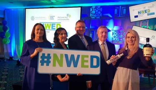
Going Local to Global" at this year's NWED held on October 18<sup>th</sup> Citywest Hotel.

The latest Dublin Region NWED network event took place on the 18th October in Citywest Hotel; the Event will be hosted by LEO Fingal in 2019.