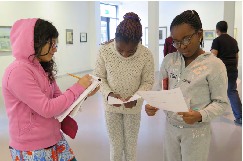
Room 13 Inquiry: Tionscadal Oideachais Ealaíne sna scoileanna Room 13 Inquiry: Arts Educational Project in Schools

The Creative Fingal programme, which will stimulate natural curiosity, enhance understanding and foster understanding, is both novel and strategic in nature, with potential to deliver the vision of the programme.