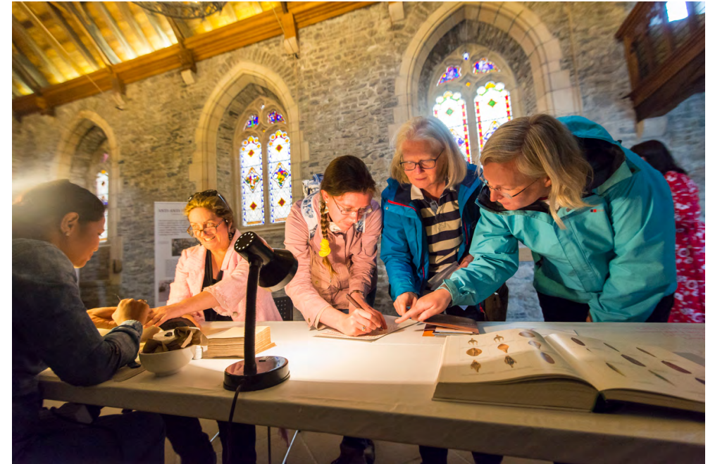
Ag breathnú ar an t-am atá thart ag Caisleáin Shoirde Exploring the past in Swords Castle

A greater focus on community engagement and consultation, is now a core aspect of Fingal County Councils work. New methods for public consultations, including for example, the Your Say, Your Way consultation with young people involved in creative programmes at Draíocht in Dublin 15, are being applied to inform the development of strategies including the Creative Ireland programme and the Heritage Plan. Participants descriptions reflect the broad nature of creativity encompassing creative ideas, making and doing.