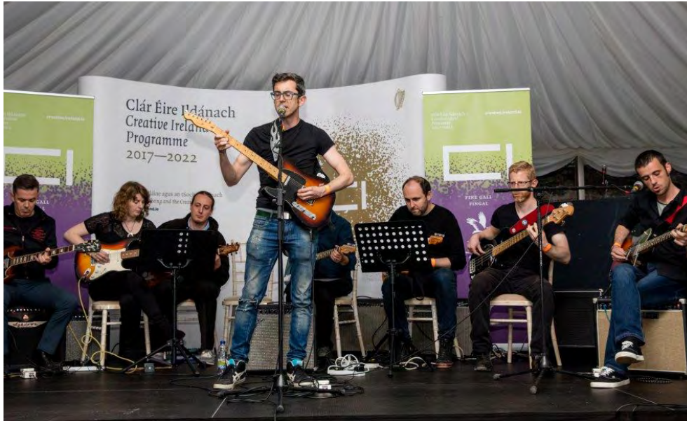
Ag ceiliúradh Seoladh Clár Éire Ildánach Fhine Gall Celebrating the launch of the Fingal Creative Ireland programme

gcomhthéacsanna difriúla. Is faoi gach aon scoil atá sé cén chaoi a n-oibrítear an stiúideo ach caithfidh sé bheith freagrúil do riachtanais agus samhlaíocht na leanaí agus na n-ealaíontóirí atá páirteach ann. Is éard atá i ngach stiúideo ná spás inar féidir le daoine smaointe, saineolas, áiseanna, agus freagrachtaí a roinnt, mar aon le healáin a dhéanamh le linn an lae scoile. Tá forbairt scileanna fiontraí agus fiontraíochta na ndaltaí ina gné thábhachtach den chlár.