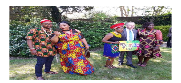
Minister Ciaran Cannon at the launch of Africa Day

Fingal County Council Community Office, in partnership with the Fingal PPN and Irish Aid supported eight events with over 1,000 people attended across Fingal to mark International Africa Day. Representatives from Fingal-based Africa groups launched the event with Ciaran Cannon, the Minister of State at the Department of Foreign Affairs and Trade with special responsibility for the Diaspora and International Development in Iveagh House recently. Events took place in Mulhuddart, Blakestown, Balbriggan, Huntstown and Baldoyle which were attended by diplomats from 9 African Embassies based in Ireland. All events were a celebration of African culture and free for all to attend.