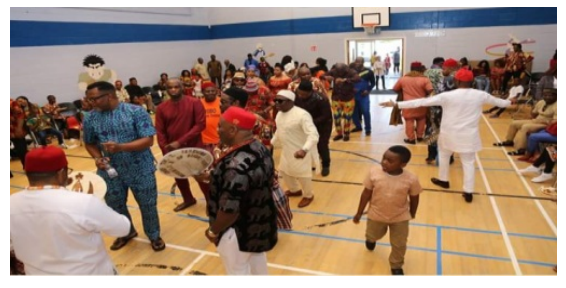
IBGO Union Dublin, Blanchardstown