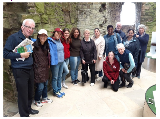
Garden Party at Áras an Uachtaráin

Fáilte Isteach Tyrrelstown tutors and students visited Trim castle, along with members of the Mountview Men's group and the newly established Laurel Lodge Men's group as part of Fáilte Tyrrelstown outreach work, supported by the Department of Justice Integration Funding Scheme. Fáilte Isteach Tyrrelstown will resume in September after the summer break.