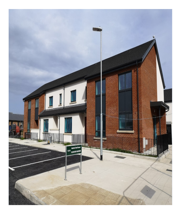
Rolestown – 26 Houses