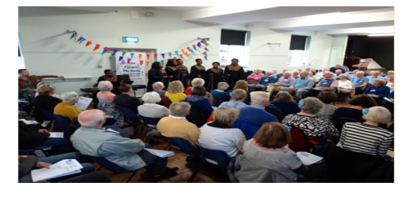
Forget me Nots, Balbriggan