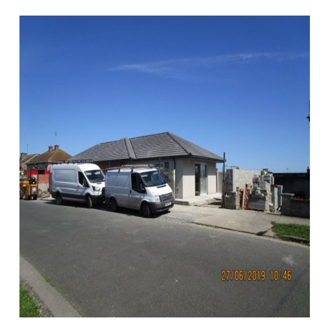
Church Road, Mulhuddart - 22 houses

Pinewood Community Refurbishment – 2 houses