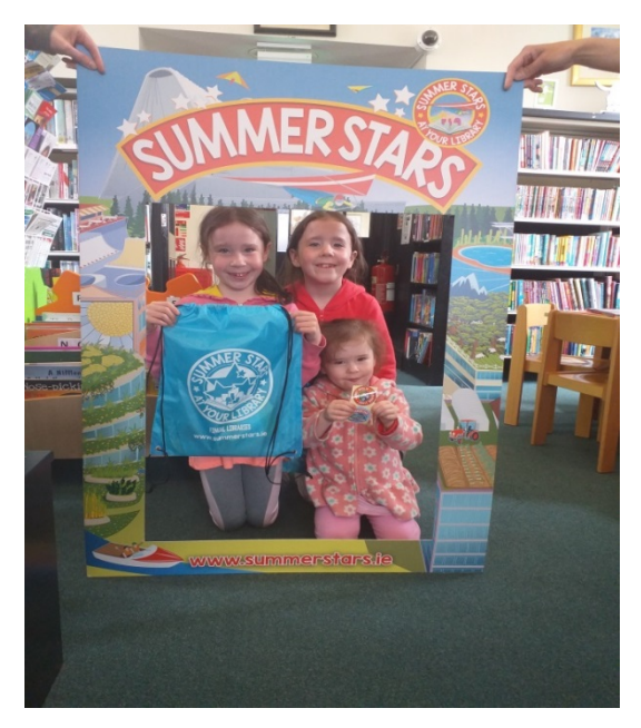
Launch of Summer Stars at Garristown Library

The Mobile Libraries are out and about this summer and as pictured above, were a welcome addition at the Meakstown Family Day on 22<sup>nd</sup> June. They were also at Balbriggan Summerfest, the Safer Together Family Fun Day at Blanchardstown and at Flavours of Fingal.