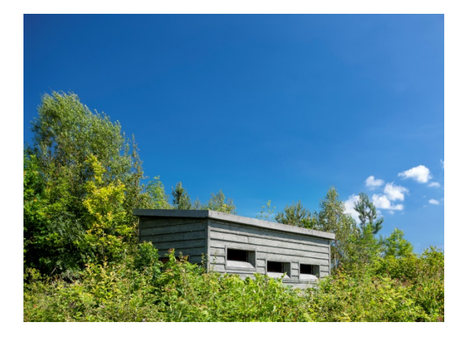
Public Art- Infrastructure Public Art Programme 2017 – 2021 – Buildings and Public Spaces

The Hide Project has been entered in to this year's Pride of Place Awards under the Creative Place Category for Lusk. The arts office will host the judges and introduce the range of community engagement delivered with this project locally and have invited several groups to our judging session including, Birdwatch Ireland, Men's Shed, Lusk, Eve Plantmarket, The Political Animal, public and artists.