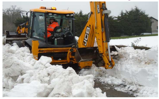
Clearing of snow on the Lucan Clonee Road