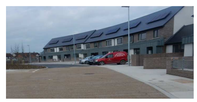
Racecourse Common - Phase II