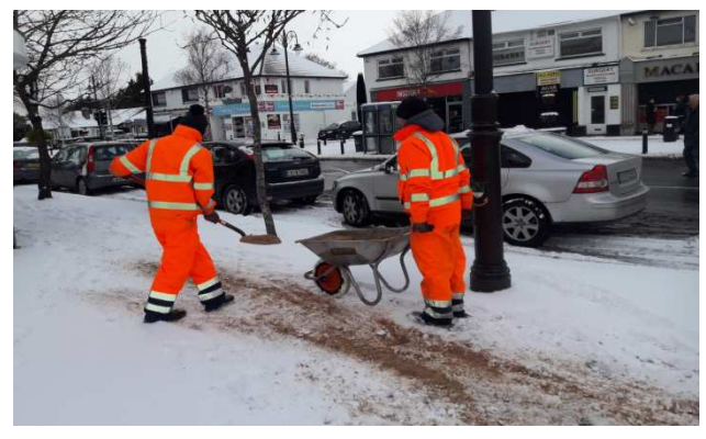
Salting footpaths in Blanchardstown Village

Post the red alert period crews continued to work on ensuring roads in the county were passable and in ensuring that hospitals, nursing homes and businesses in towns and villages could continue to deliver services. In addition to the arctic conditions high tides caused flooding at a number of coastal locations particularly in Malahide and Portmarnock. A key focus was ensuring that schools were accessible following reopening on Monday, March 5 and in dealing with road flooding caused by the thawing snow in a number of locations across the county.