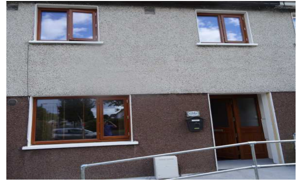
Example of Window & Door Replacement in Dublin 15

The Windows/Doors Replacement Programme for 2017 has commenced in Sheepmore Estate, Dublin 15 and a procurement process is ongoing in respect of the remaining estates in Dublin 15.