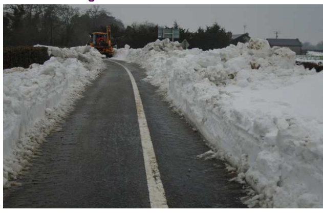
Lucan Clonee Road post snow clearance