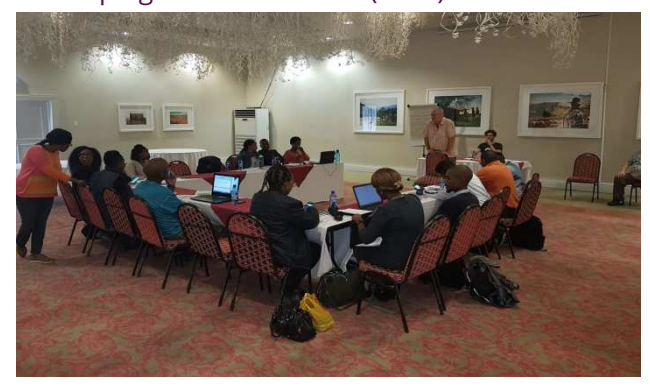
FCC Staff Training Local Planners

Planning workshops were conducted with eighteen local Planners on the theme of developing Local Area Plans (LAPs).