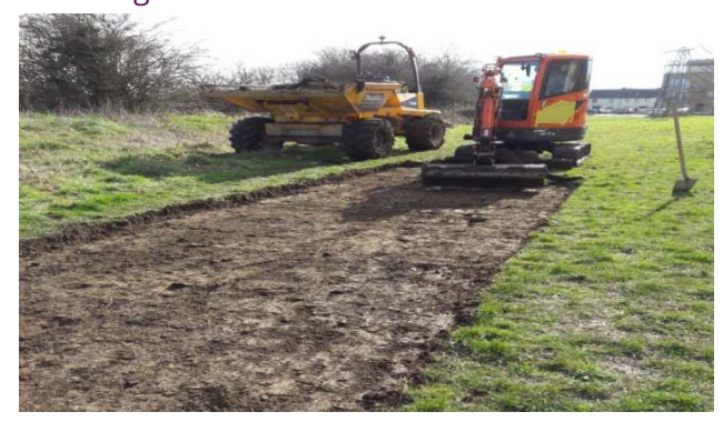
Ashton Broc Footpath Layout

Works have commenced on a footpath in the Broadmeadow River community park at Ashton-Thornleigh.