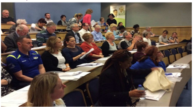
Participants at the Finance Training Masterclass

This training course aims to encourage participants to take an overarching look at the importance of good financial management, reconciliations, understanding debtors and creditors, data input, accurate reporting and the importance of accountability for boards. The course also aims to assist treasurers to interpret the information contained in TAS finance reports, highlight the importance of good reporting practices and will provide user friendly solutions to ensure good financial management procedures are implemented at board level.