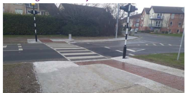
Navan Road Pedestrian Crossing Contract by KN Networks is now 80% completed.

The Traffic Signals 2017 Contract work by TSL is continuing on various sites. Of the 13 sites, 11 are 80% completed and are awaiting ESB works. The remaining 2 sites have yet to commence.