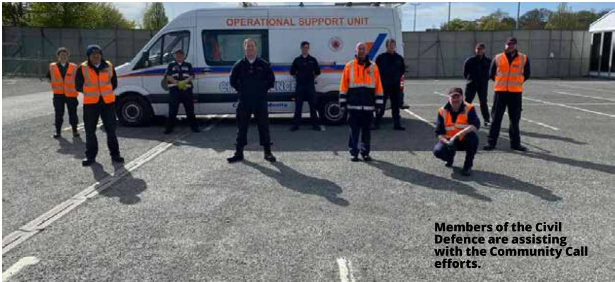
Members of the Civil Defence are assisting with the Community Call efforts.