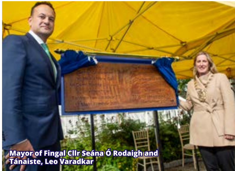
Mayor of Fingal Cllr Seána Ó Rodaigh and Tánaiste, Leo Varadkar

Cllr Seána Ó Rodaigh, officially opened the redevelopment alongside the Tánaiste, Leo Varadkar, TD, Fingal County Councillors, Oireachtas members, volunteers and members of the Shackleton Family.