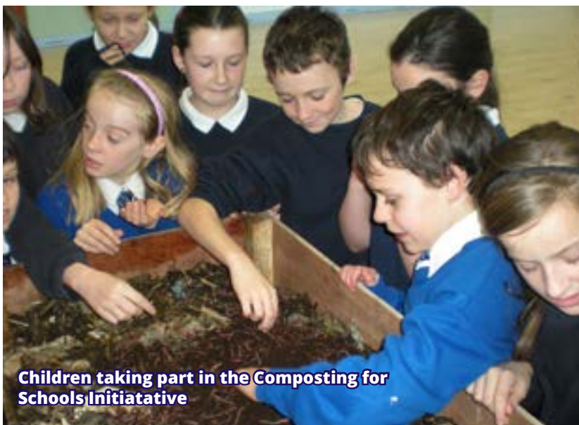
Children taking part in the Composting for Schools Initiative

Places are limited and are given on a first come first served basis. So please do not hesitate to jump on this unique opportunity by visiting www.compostingireland.ie/schools/