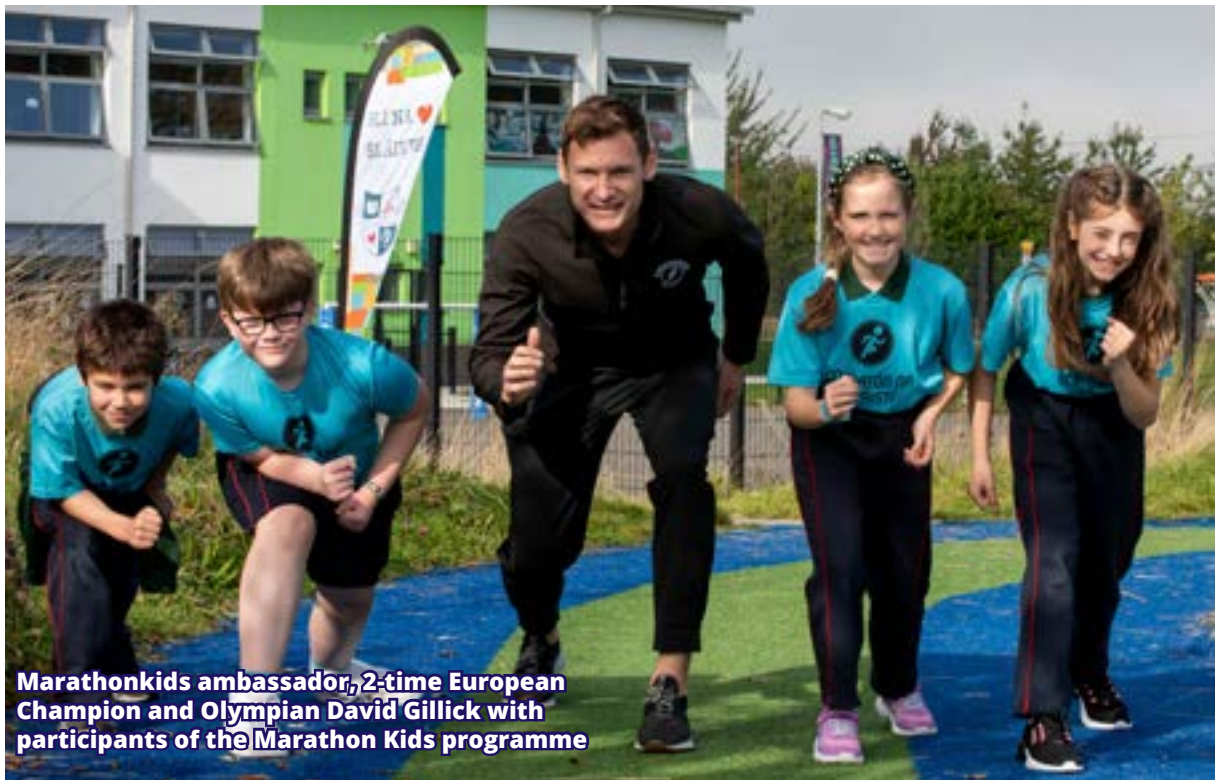
Marathonkids ambassador, 2-time European Champion and Olympian David Gillick with participants of the Marathon Kids programme

Marathonkids ambassador, two-time European Champion and Olympian David Gillick stated: "The Marathonkids Ireland programme is going from strength to strength and has seen significant growth in the last six years. Over 40,000 students and 300 schools across Ireland have completed the programme to date. In 2021 we will see the Marathonkids participation and completion surpass 50,000 students since launch".