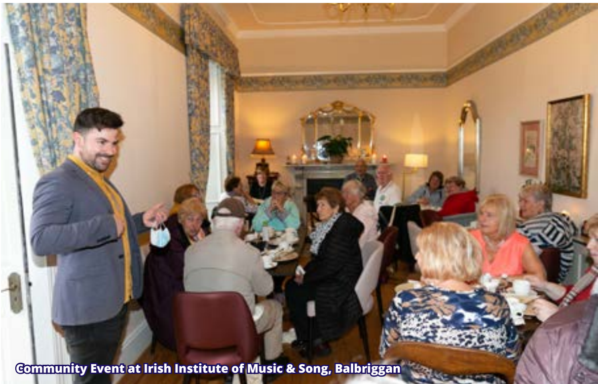
Community Event at Irish Institute of Music & Song, Balbriggan