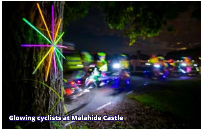
Glowing cyclists at Malahide Castle

Under the Safe Routes to School Programme, 3 priority sites have been chosen from the initial list of 11 schools as part of Phase 1. These accommodate 5 schools to include St. Benedicts & Castaheany, Rush & Lusk Educate Together and Bayside Jnr and Snr Schools. Engagement has commenced with the schools and Hands-Up surveys have been completed by Staff and Children to determine the preferred method of travelling to and from school.