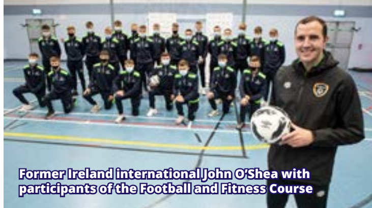
Former Ireland international John O'Shea with participants of the Football and Fitness Course

Over the course of the 2021-22 school year, the 25 Transition Year students participating in the programme will mix academic subjects such as Maths and English with a range of football coaching courses