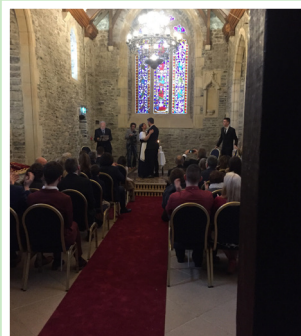
Swords Castle hosts first civil ceremony - P3