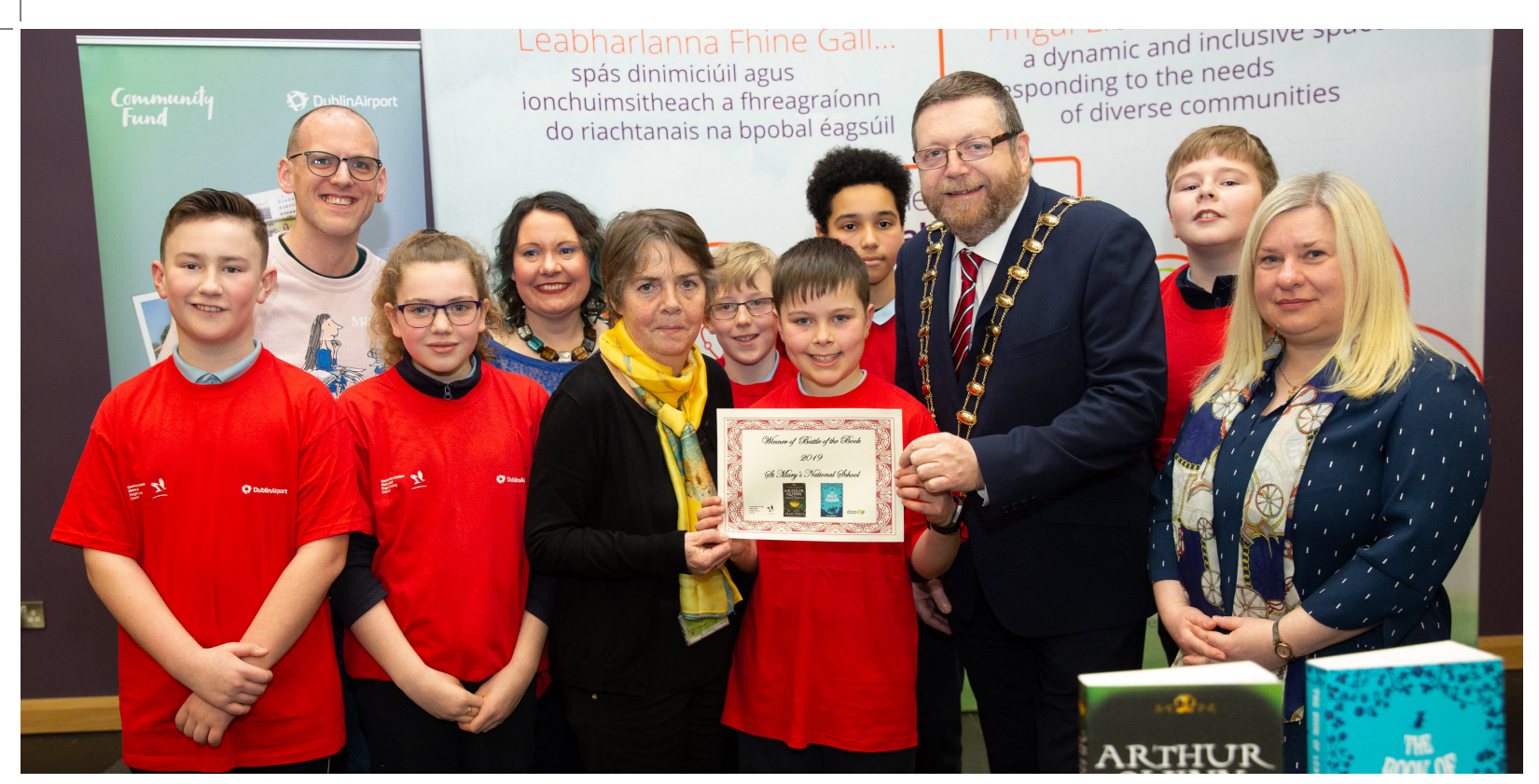
The final of the Battle of the Books was won by St Mary's NS in Garristown.