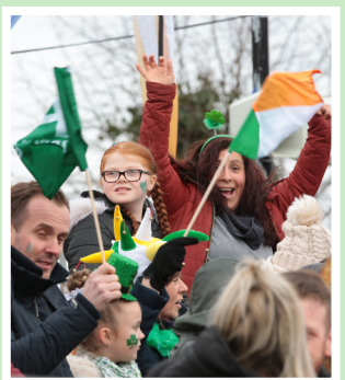
Fingal prepares for St Patrick's Day parades- P6