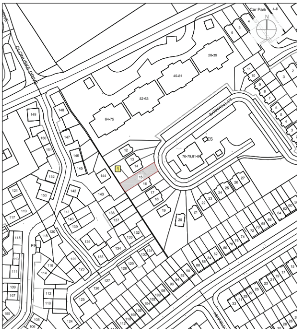
BARNWALL COURT SITE LOCATION MAP – Scale 1 : 500