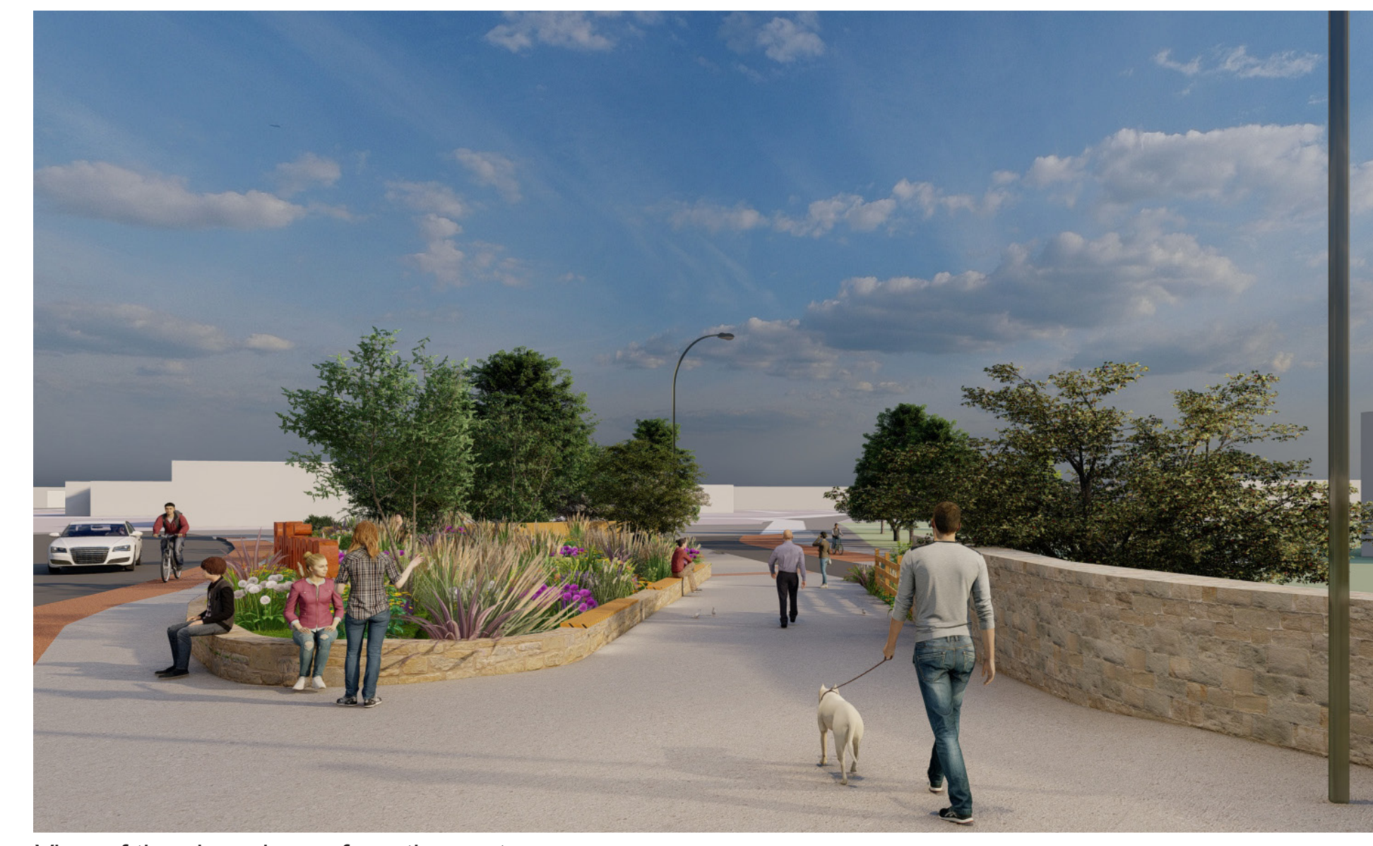
View of the shared area from the east.