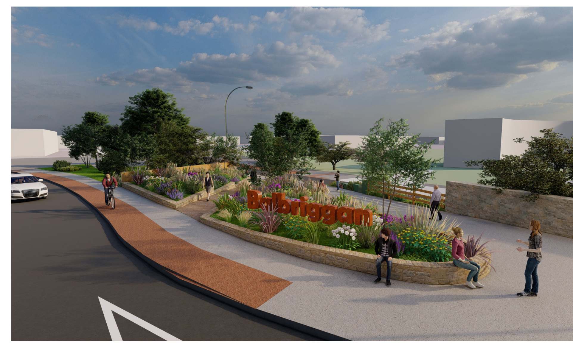
View from roundabout towards the planter and potential sculptural sign.