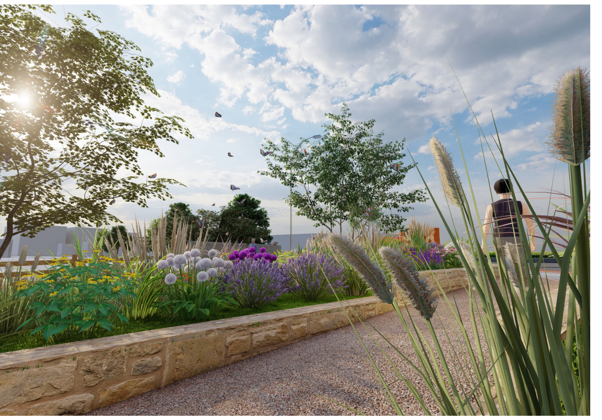
Close up view of the stone retaining planter wall and proposed herbaceous and tree planting.