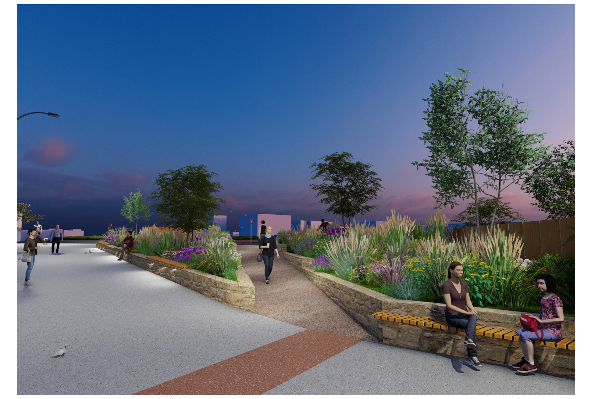
Illustration of the site at night, seating opportunities and lighting.