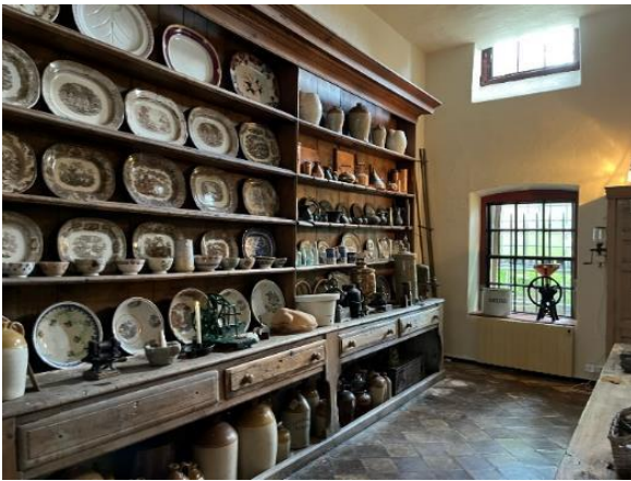
Newbridge House Kitchen

Welcome to Blas, Fingal's Food Heritage project! In Fingal we have strong traditions of horticultural, farming and fishing. Our food heritage encompasses everything from grandparent's recipes, cooking and utensils, traditional ways of farming and fishing, to folklore, the famine, and fieldnames.