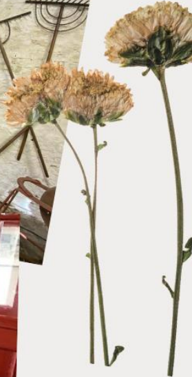
Fingal's food heritage is all around us! (Skerries Mills, the farm and servants' quarters at Newbridge House)