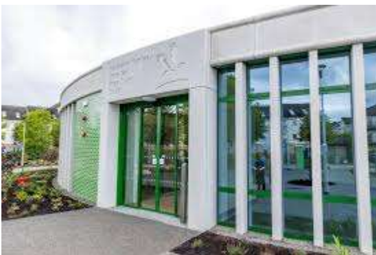
Meakstown Community Centre