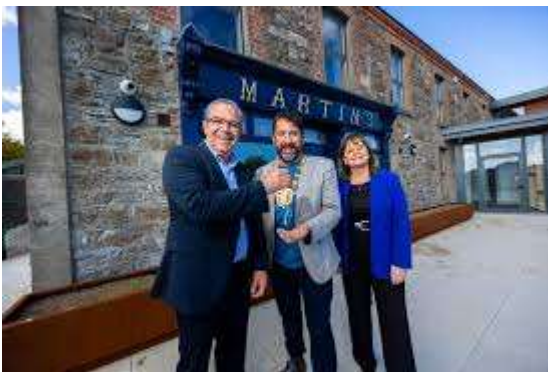
Key exchange Rush Multipurpose Youth Facility