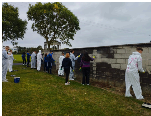
Rush Tidy Towns

Keep up the amazing work—together, we are creating a future free of waste and graffiti!