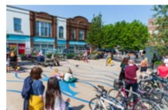
Quality Public Space