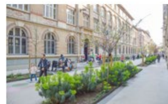
Well Connected Local Places