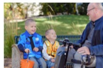
Accessibility For all